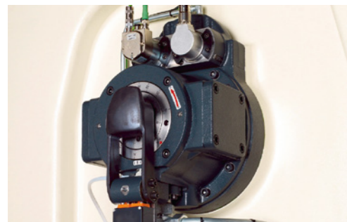
Quick stroke change allows more flexibility.

Our customer HONGFA was able to increase their productivity following a training course by BRUDERER personnel. The company's machine operators are now able to produce stamped parts at the most appropriate stroke speed. Production processes were optimised, vibration was reduced and the stamping speed and stamping times were increased. This also led to a significant improvement in the quality of the stamped part.